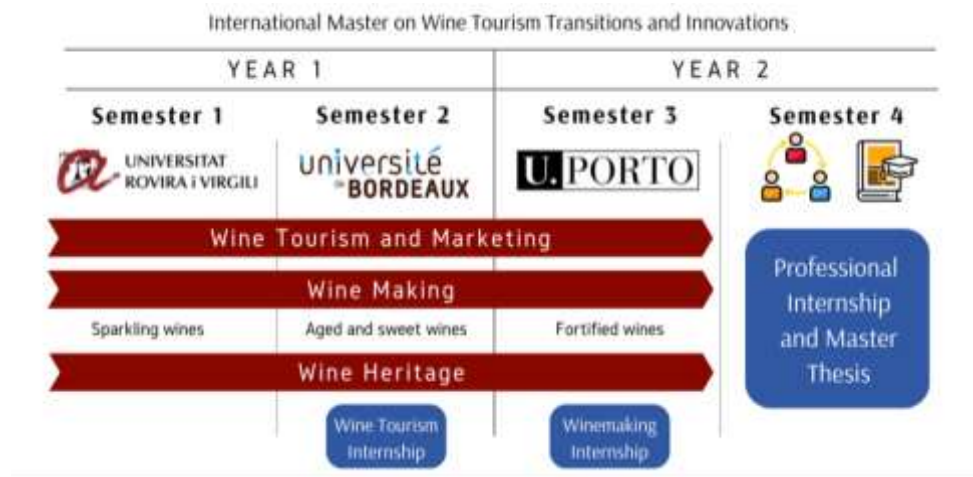
Graphical presentation of the WINTOUR General Structure